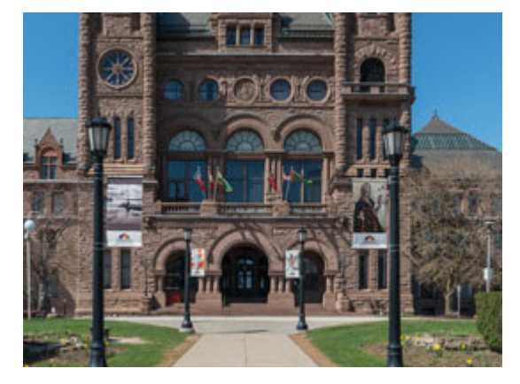
The Ontario budget begins to set the course for economic recovery, but Ontario workers must maintain pressure for a fair and equitable vision.