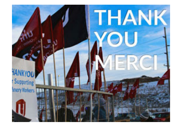
Unifor Local 594 thanks the many, many unions and organizations that helped them during the 7-month lockout.